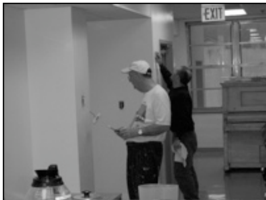
Above and Right: Volunteers paint the dining room and spiff up the kitchen at Parkridge Harbor.