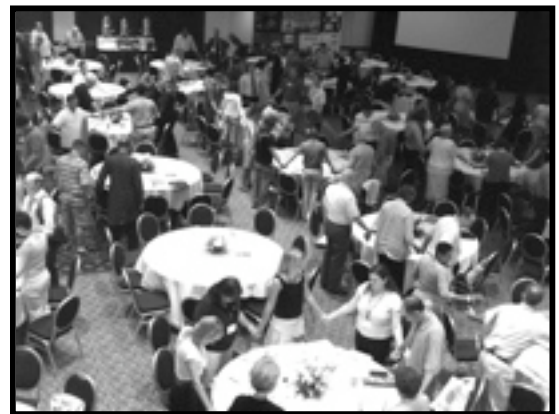
Closing Prayer at the AIDS Summit