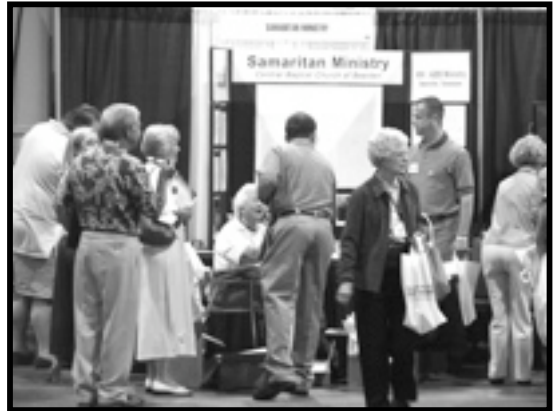
A busy Samaritan Ministry booth at the Cooperative Baptist Fellowship Assembly in Atlanta.