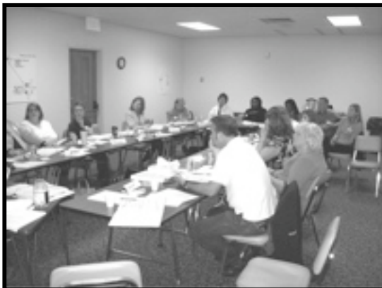
CRCS Training at Central Baptist

POSITIVE CHOICES kicked off in August with the completion of the training phase of this Comprehensive Risk Counseling & Services program directed at HIV+ inmates in four East Tennessee state correctional facilities. Promotional materials have been distributed at Brushy Mountain, Morgan County Complex, Northeastern Correctional, and Southeastern Correctional. Our counselors should begin seeing clients at these 4 facilities in October. POSITIVE CHOICES is funded through a grant from the MAC AIDS Fund.