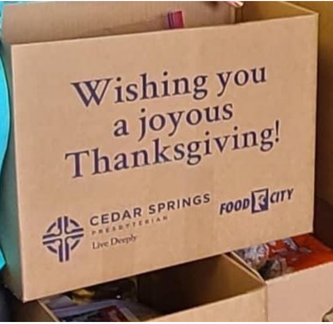
Cedar Springs Presbyterian Thanksgiving Box

Livwell is part of a network of agencies that provide HIV/AIDS support as part of the federal Ryan White Program.