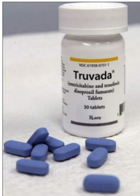
Truvada prevents the spread of HIV.

The Cooperative Baptist Fellowship , one of our long-serving financial partners, held its annual General Assembly during this same month, and the weight of this tragedy was heavy in the hearts of Baptist church leaders during this 3 day assembly.