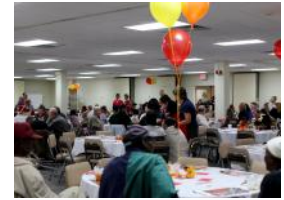
THANKSGIVING WE ARE THANKFUL FOR THE 200 FRIENDS THAT CAME TO JOIN US FOR OUR THANKSGIVING FEAST.