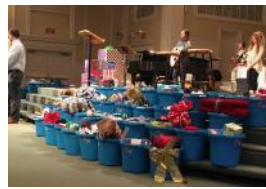
HOPE BUCKETS IN DECEMBER WE AGAIN PARTNERED WITH THE HOPE CENTER TO PUT TOGETHER MORE THAN 100 HOLIDAY HOPE BUCKETS.