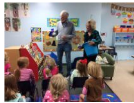
THE INNOCENCE OF A CHILD THIS WINTER WE TALKED TO SOME OF THE PRESCHOOLERS AT CENTRAL BAPTIST ABOUT JESUS AND HOW HE WANTED HIS PEOPLE TO CARE FOR THE SICK.